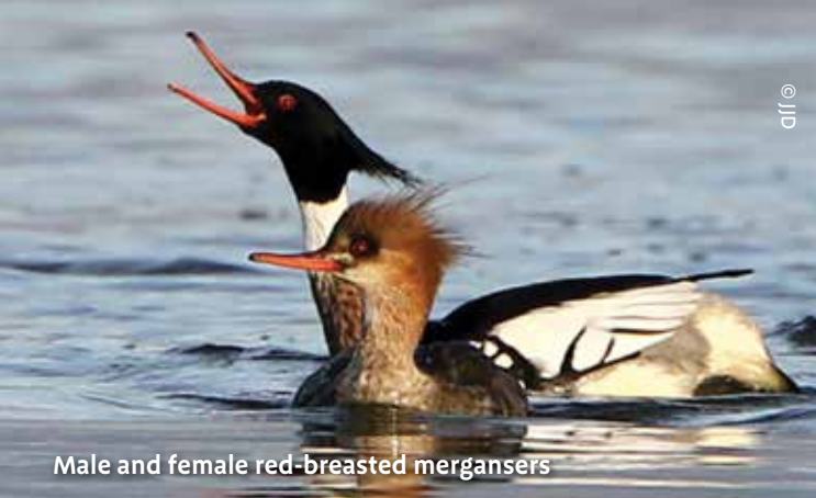
Male and female red-breasted mergansers