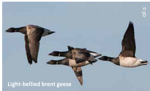
Light-bellied brent geese

The tall building you can see on the Heugh to the right of the harbour, the Lookout on Wild Lindisfarne, is ideally placed to provide excellent