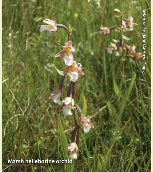
Marsh helleborine orchid

Brought ashore by water and wind, the sand of the dunes is gradually stabilised by marram grass. Once stable, dunes support many other plants. In the dune slacks (the damper low-lying areas within the dunes) several nationally important plants exist including 11 species of orchid.