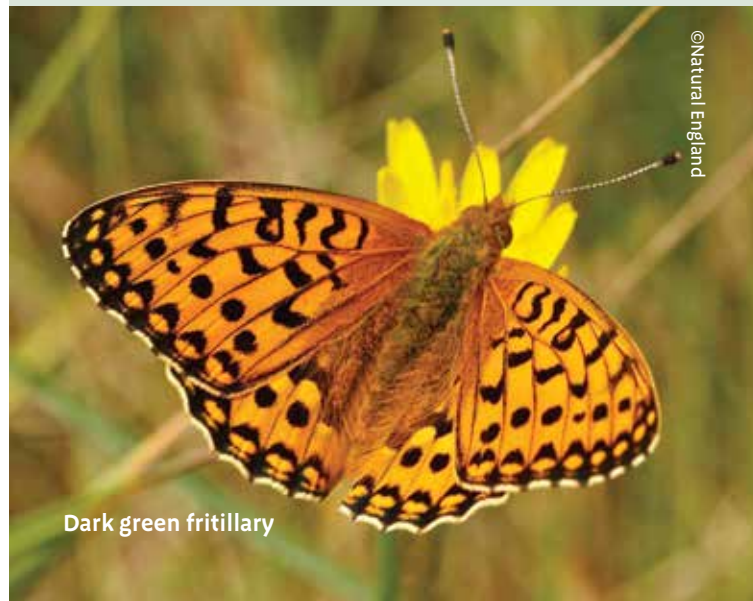
Dark green fritillary

Along the way you may be accompanied by the eerie calls of lapwings or the strident alarm of the watchful redshank. Birds of prey such as kestrels and merlins use the dry stone walls as hunting lookouts. The hawthorn hedges are a magnet for birds crossing to and from Scandinavia in spring and autumn. These migrants include thrushes such as redwing and fieldfare, in large noisy flocks, delighting in the hawthorn berries in autumn. Smaller migrants such as tiny goldcrests, hunt for insects among the branches.